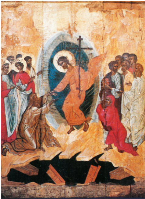
Harrowing of Hell

In the development of the world and the Earth, the most diverse types of demons have arisen since time immemorial, and new ones are constantly being created by human beings,